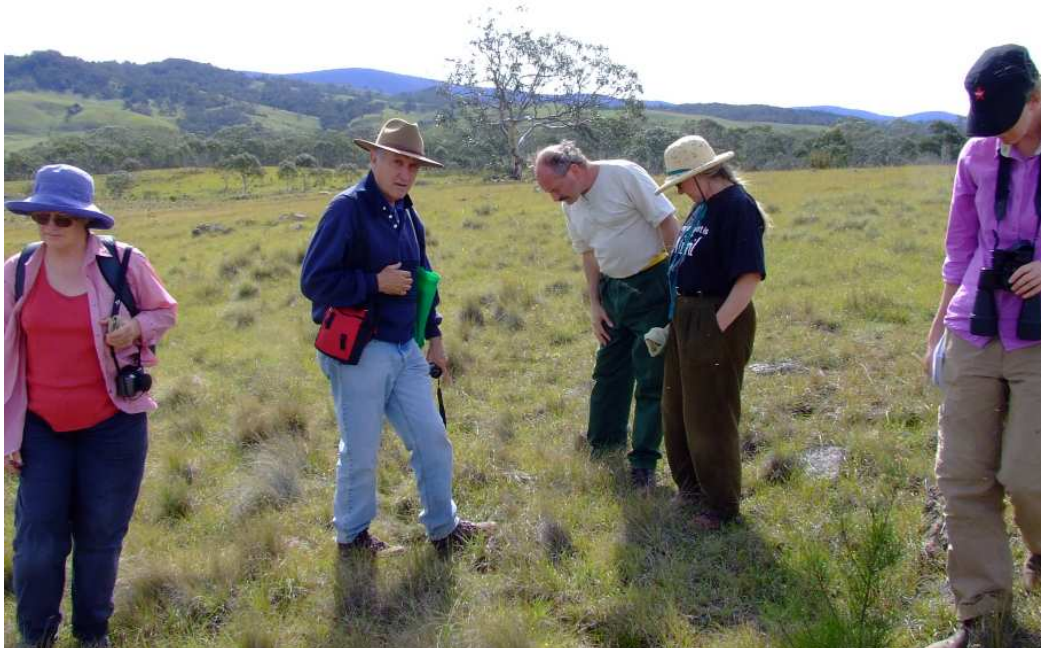
Photo: STGE CMN members admiring wildflowers at Jerrabatgulla, The Parlour Grasslands (see next page).